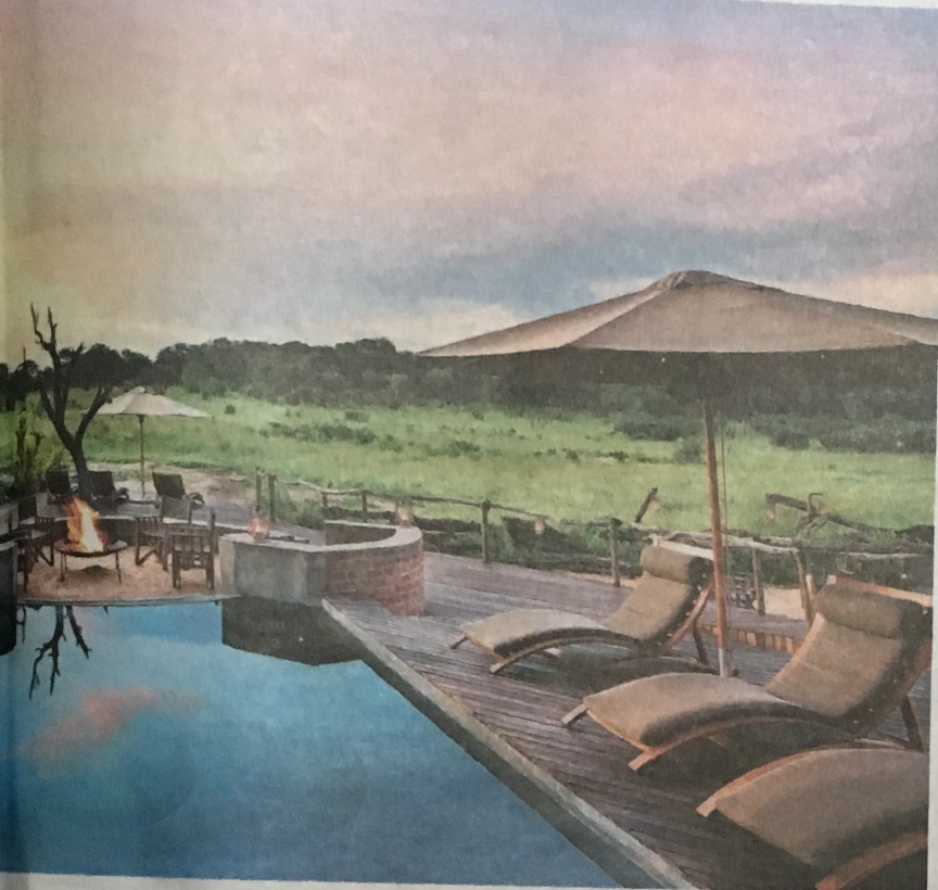
pink tees, with Aardvark Safaris (aardvarksafaris.co.uk)