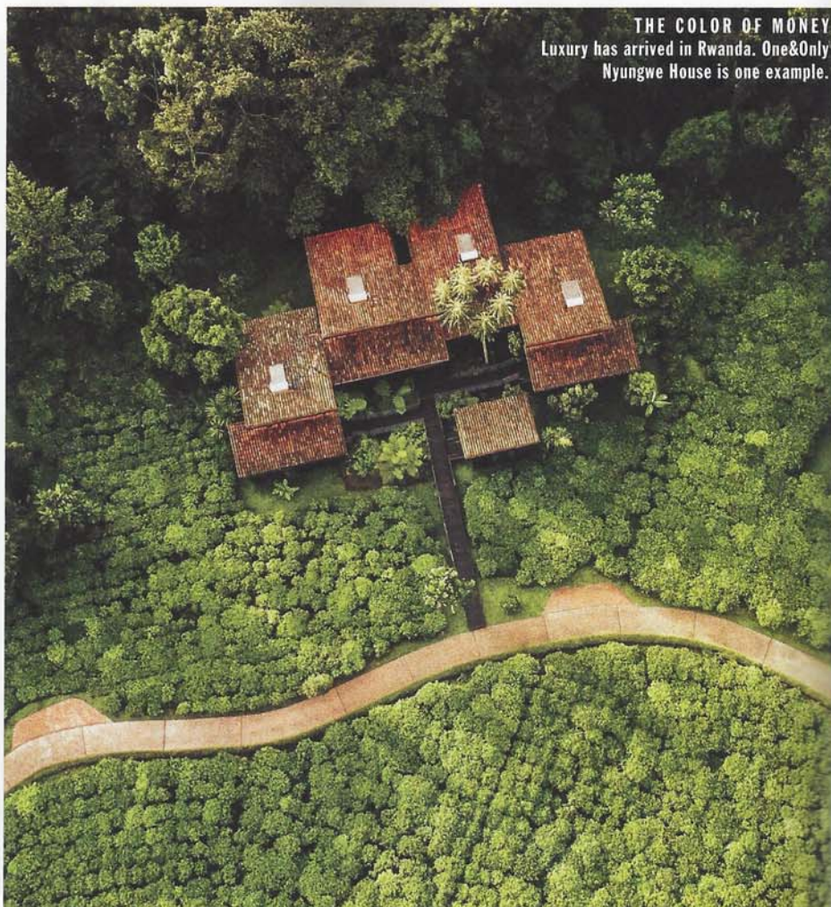
THE COLOR OF MONEY Luxury has arrived in Rwanda. One&Only Nyungwe House is one example.