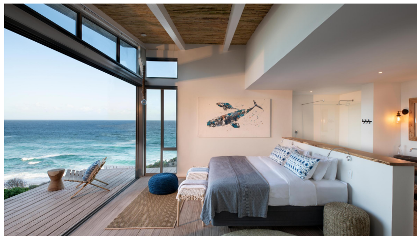
One of the lodges at Lekkerwater